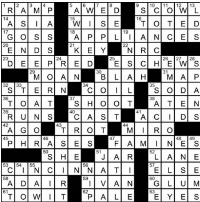
Solution to puzzle on page 33